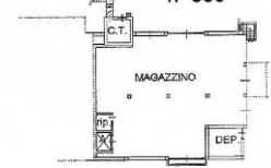
PIANO SEMINTERRATO h=350