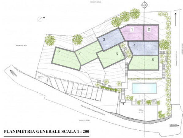
PLANIMETRIA GENERALE SCALA 1 : 200